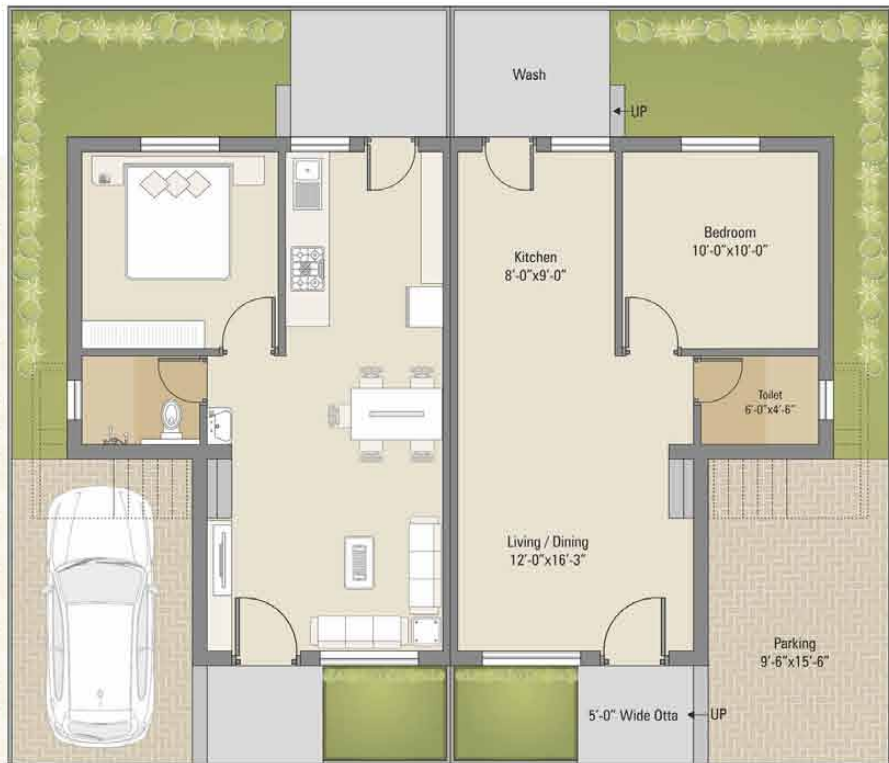
TYPE - A1 Ground Floor Plan